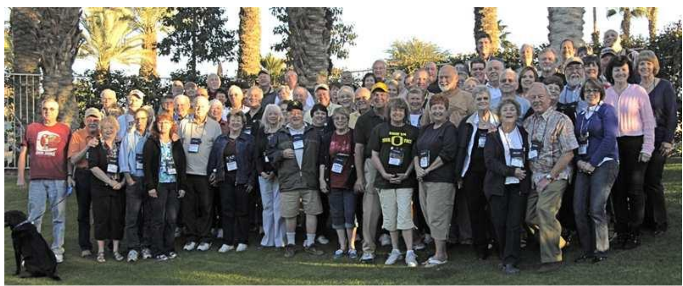
Alfa SeeYas Chapter members attending the Indio Pre-Rally at Emerald Desert Resort CA