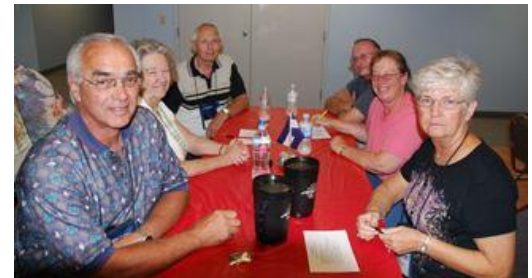
Let the games begin!