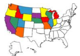
My Visited States Map

Note from the Editor: After I included my "Visited States" map in the last Newsletter, several members emailed wanting to know where I got it. In case you are interested, it comes from www.visitedstatesmap.com . You check boxes for states you have visited, then save the jpg picture it creates to your hard drive. I use the 180 x 140 pixel size on my little website at www.donandpatty.us . I've also seen them used at various Message Boards in peoples' signatures. --Patty