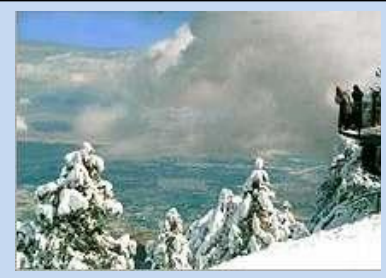
View from the Palm Springs Tram

There's still some spaces left, but they won't last long. Suggest you get your Reservation Form in pretty quickly if you want to attend. And why wouldn't you want to attend (that is, if you can). Blue skies, sunshine, typically mid-70's, and Alfa friends, new ones to meet, old ones to see again.