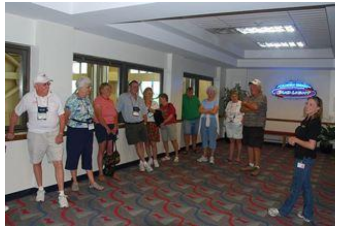
Budweiser Brewery Tour