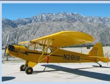
Palm Springs Air Museum