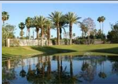
Emerald Desert RV Resort