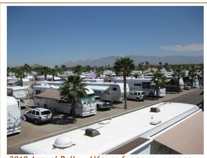
2010 Annual Rally - Alfas as far as you can see ...

We also had a used book fair that resulted in a donation of $233.25 to the Tucson Community Food Bank from books sales and eight boxes of leftover books that were donated to the Veterans' Hospital in Tucson.