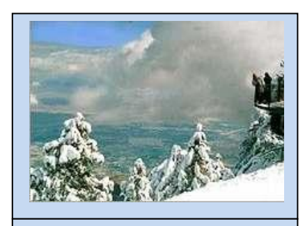
View from the Palm Springs Tram

Your editor has attended the Indio Pre-Rally and FMCA for 4 years. We wouldn't miss it for anything. The best bunch of folks, gorgeous weather, lots to see and do ... what more could you ask for in a Rally? Hope to see you there!