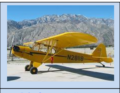
Palm Springs Air Museum