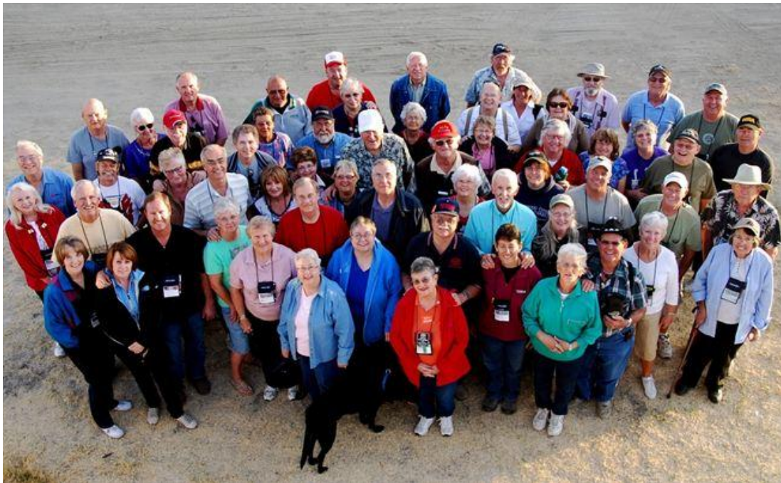
Most of the AlfaSeeYas who attended the Indio FMCA Rally, January 9, 2010

Speaking of INTO (our FMCA Area Association), this was in a recent Newsletter: